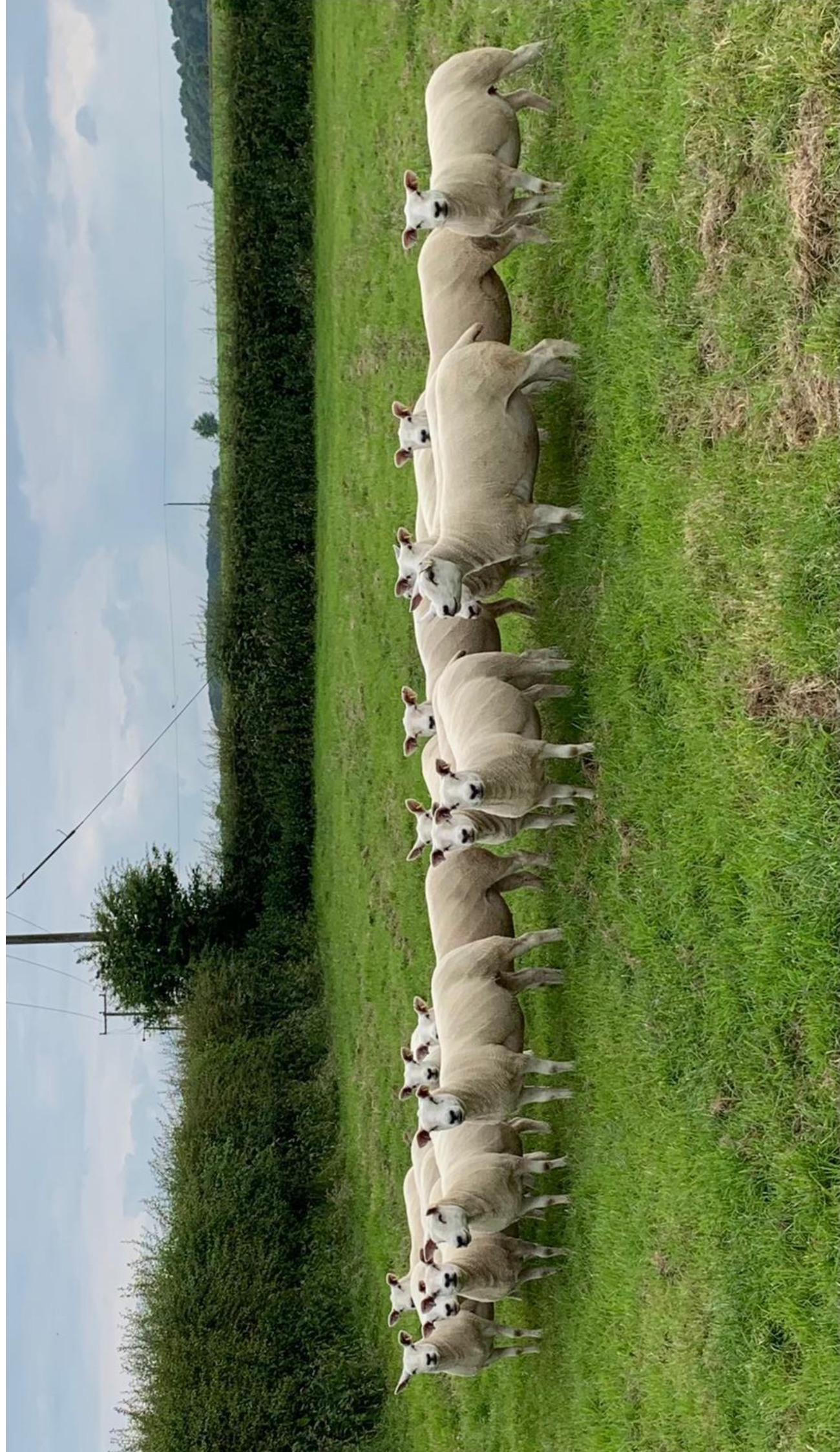
Entry from D.T Sowersby, Etton Pens 445-446